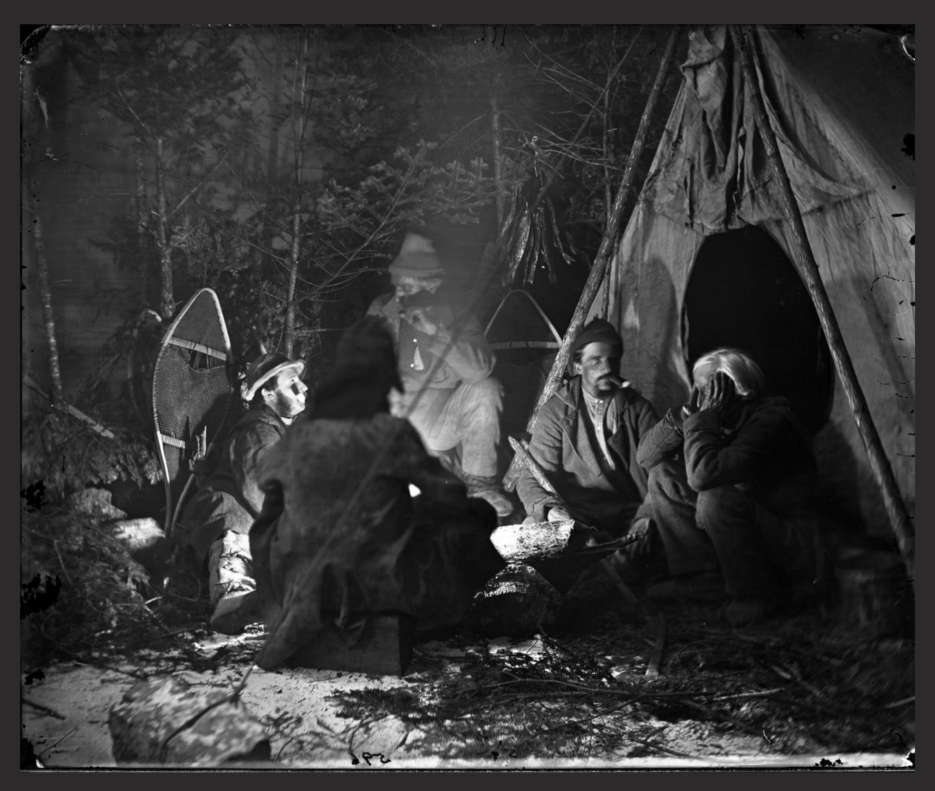
William Notman, "Around the Campfire, Caribou Hunting Series," Montreal, QC, 1866.